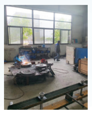
Daily operations of Tengzhou Kaiyuan