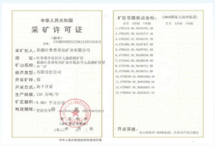
Xingliang Mine's mining license of 1.2 million tons